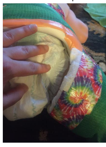
Step 1: Rip the Velcro sides off and tuck the smaller diaper all the way in the cast to cover all areas